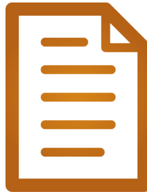
List of Follow-up Initiatives (Annex)