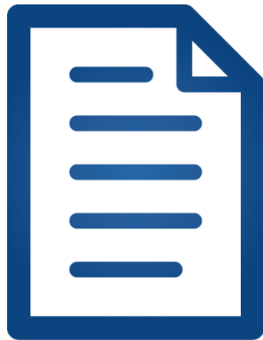
Action Plan Communication

Adopted by the Commission on 2 December 2015