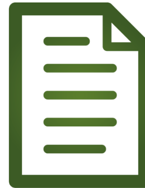
4 Legislative proposals on waste