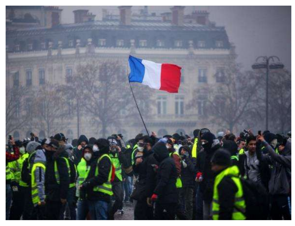
....and No Environmental Action without Social Protection