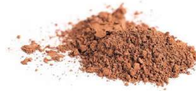
Near native lignin

CERTIFIED RAW MATERIAL FULLY TRACEABLE SUPPLY CHAIN MINIMIZED CO2 FOOTPRINT MINIMAL USE OF RESOURCES