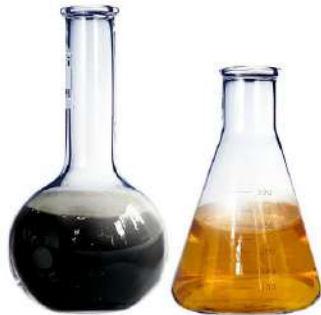
Low inhibitors sugars