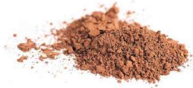
Near native lignin