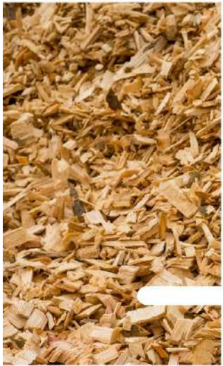
Sustainable biomass residues