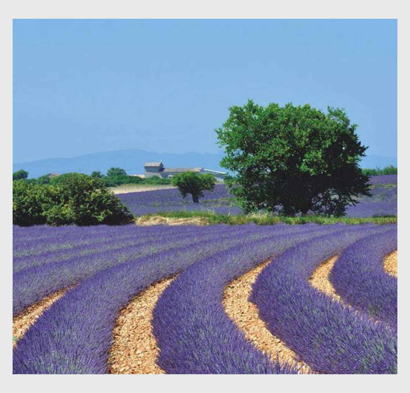
Botanical extracts and minerals