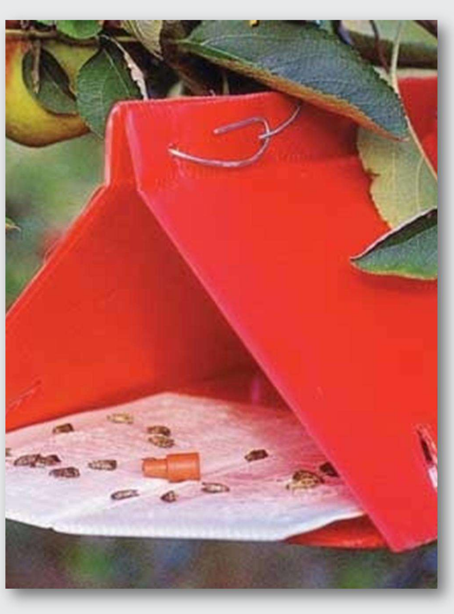
Insect pheromones and plant kairomones that affect the behaviour of specific insects or plants