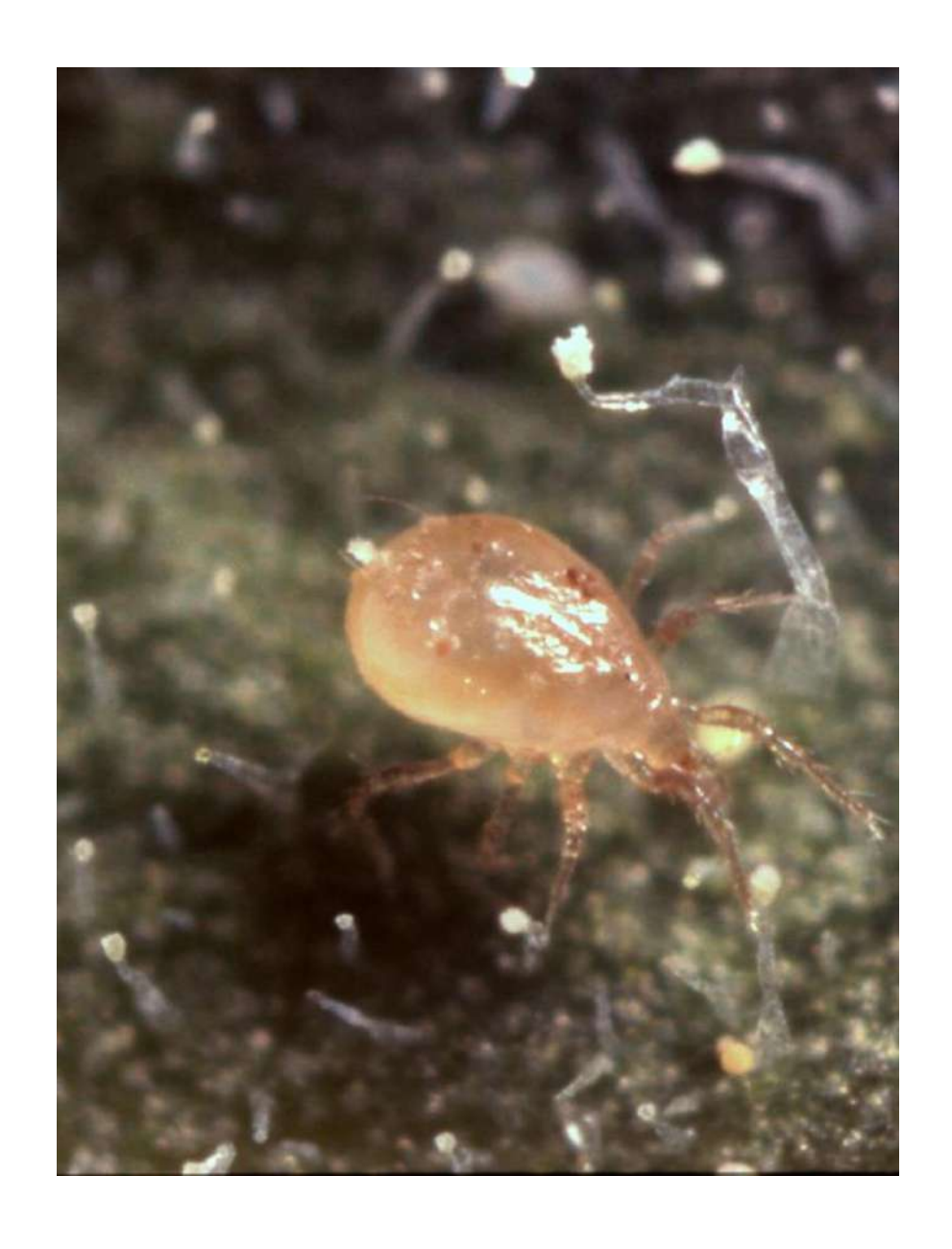
Beneficial Insects, mites and nematodes that control other insects and mites