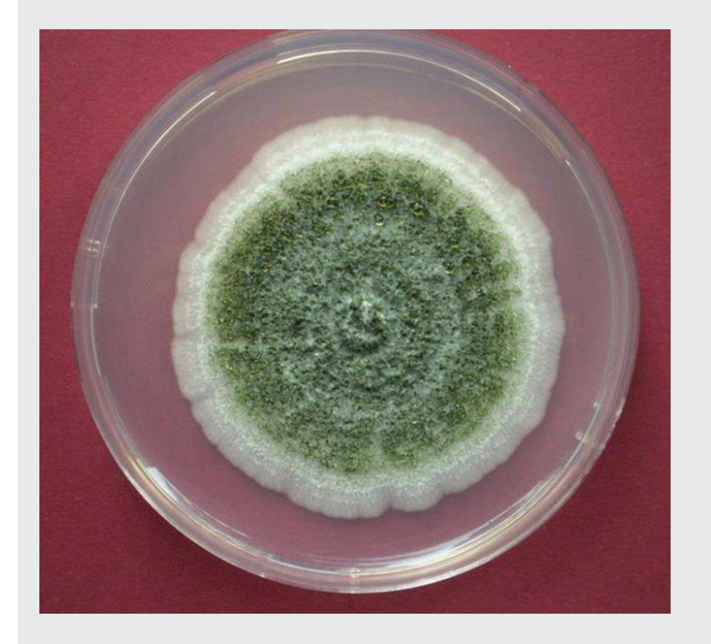
Micro-organisms that outcompete or control pests and diseases